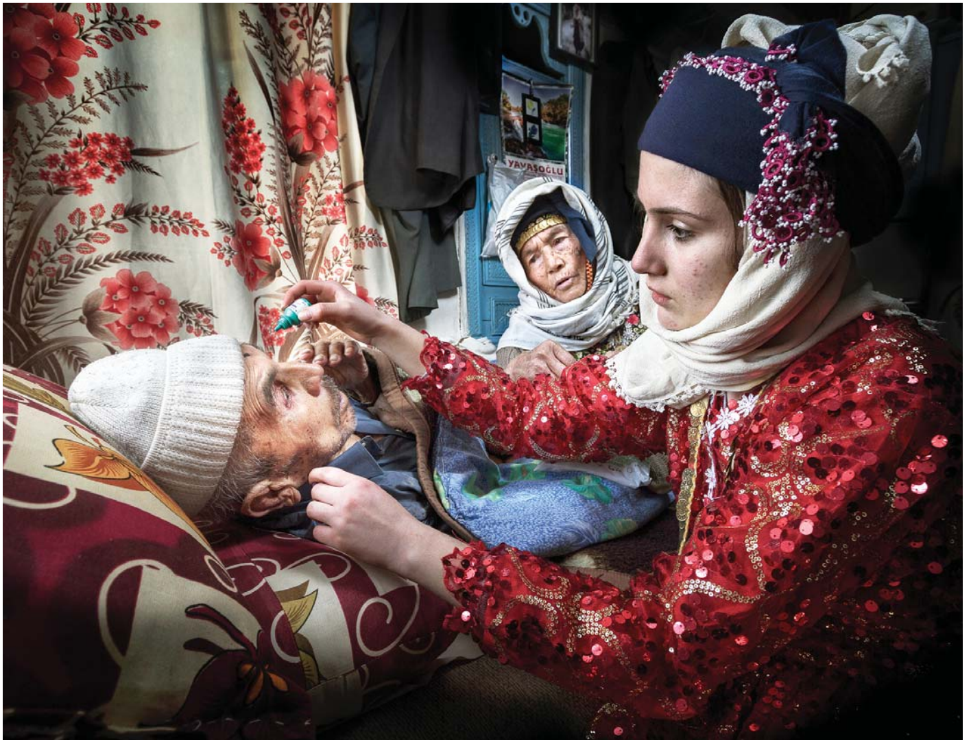
HIFA Photo Award Winner 2018: © 2016 Leyla Emektar, Courtesy of Photoshare