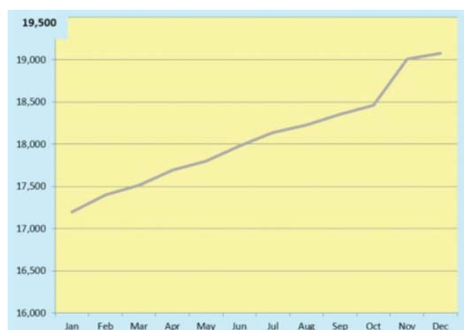
Membership growth during 2018 (all forums)

Every day thousands of children and adults die needlessly because they do not receive basic life-saving interventions - interventions that are often locally available but are simply not provided due to indecision, delays, misdiagnosis, and incorrect treatment. Many would still be alive today if those responsible for their care had access to basic healthcare information. For example, 6 in 10 parents of children with diarrhoea in India believe they should withhold fluids , contributing to hundreds of unnecessary deaths every day in India alone. HIFA members report a similar picture of unnecessary deaths in all low- and middle-income countries (LMICs), not only for childhood diarrhea but for all life-threatening diseases and injuries of children, women and men.